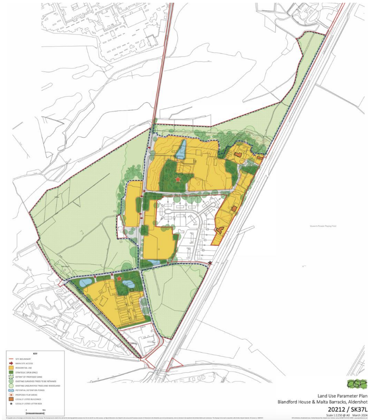
Figure 1 – Approved Land Use Parameter Plan